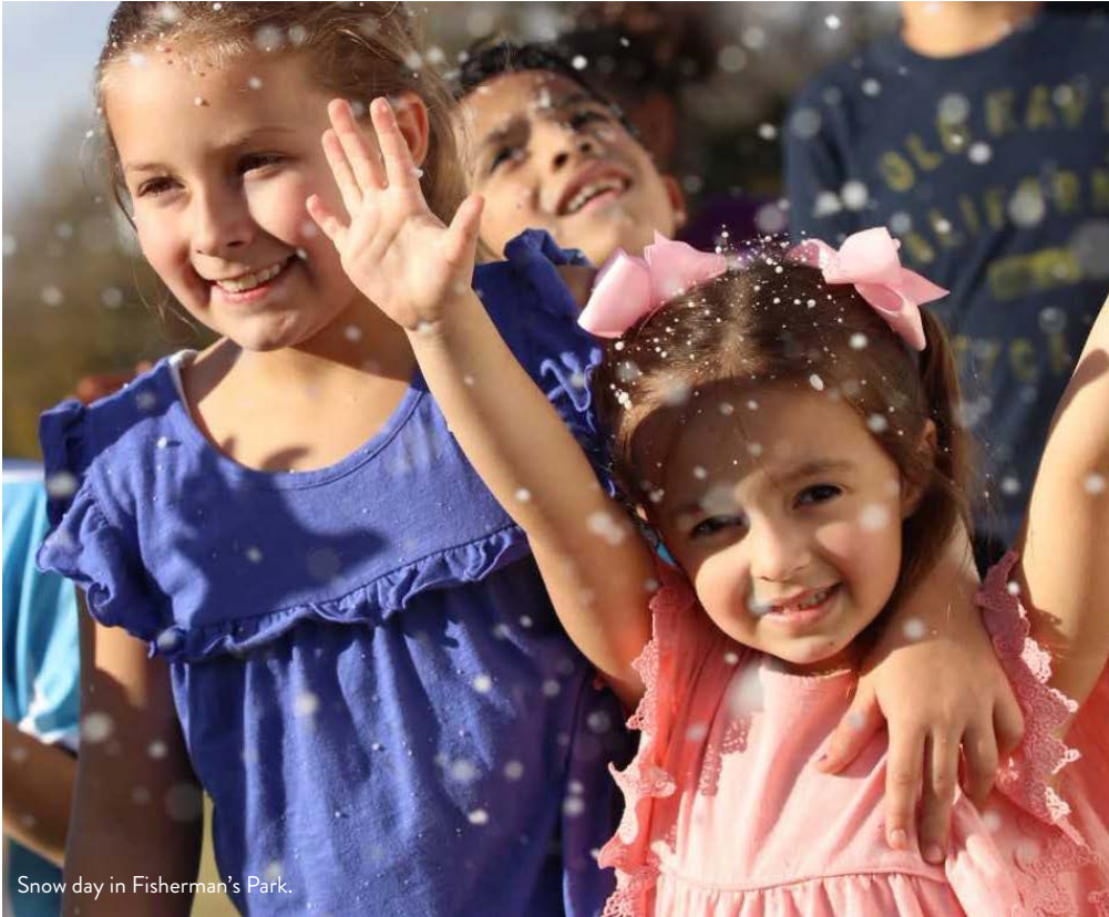
Snow day in Fisherman's Park.

District, which has an enrollment of over 10,000. Bastrop ISD's boundary covers an area of nearly 450 square miles and includes the communities of Bastrop, Cedar Creek, Red Rock, Rockne, Paige and vast rural areas of Bastrop County. The District's Colorado River Collegiate Academy was one of only 400 institutions that earned all possible Academic Distinctions in 2016, with other schools in the district earning distinctions in social studies, science, math, and postsecondary readiness.