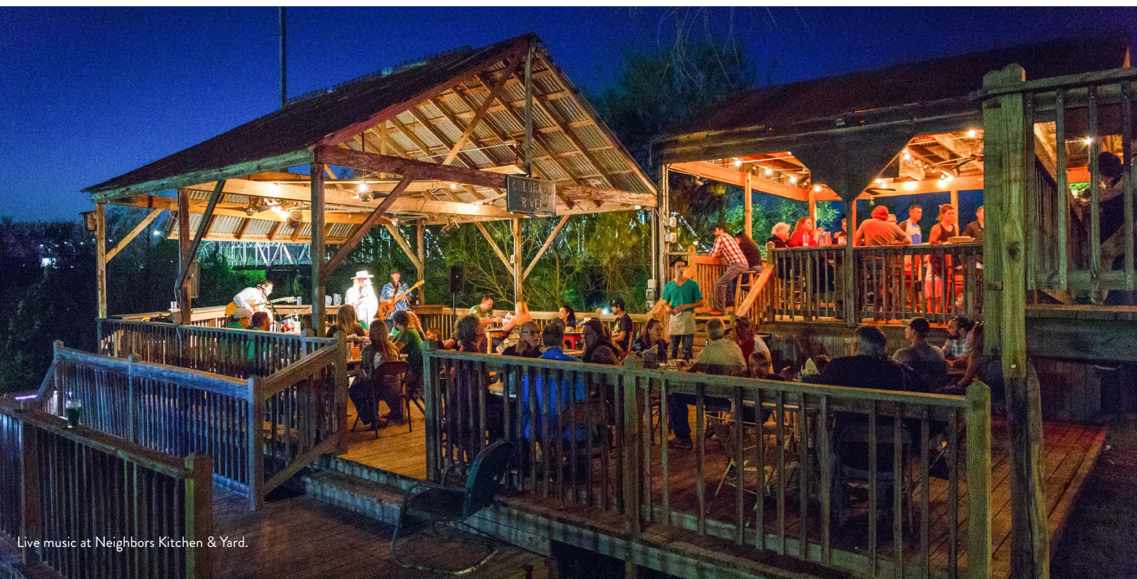
Live music at Neighbors Kitchen & Yard.

This position has the responsibility for oversight of managing boards, commissions, and committees; making recommendations to management and Council; working with community organizations and private industry; and developing alliances to identify and complete goals. Other duties include but are not limited to, implementing strategic goals identified by the City Council, facilitating operations of