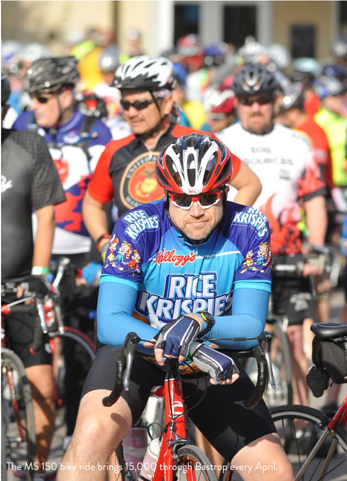
The MS 150 bike ride brings 15,000 through Bastrop every April.