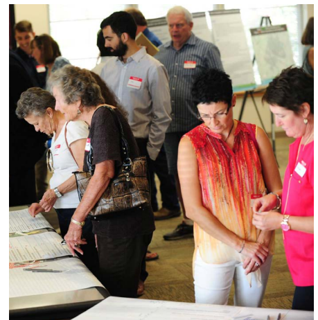
Citizens participate in Bastrop's Comprehensive Plan.

While much of the City's incorporated area remains undeveloped, the Comprehensive Plan provides an approach to encourage in-fill development and renovation of existing uses within and around the City's downtown area. It also discusses the growth opportunities along the Highway 71 corridor and the efforts needed to manage growth in these areas. The Plan received a Comprehensive Planning award from the Central Texas Section of the Texas Chapter of the American Planning Association in 2017.