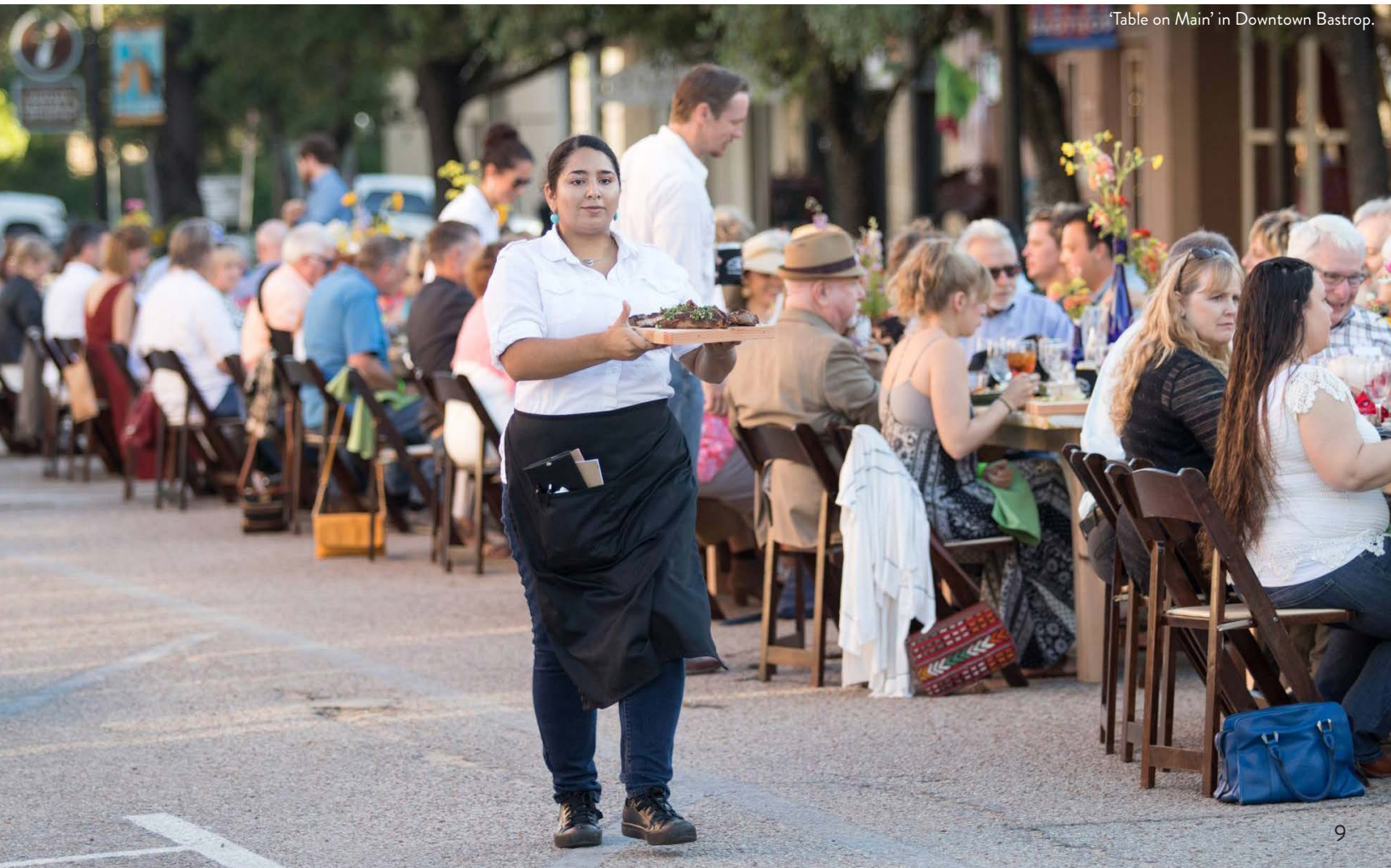
'Table on Main' in Downtown Bastrop.

The City of Bastrop is an Equal Opportunity Employer and values diversity in its workforce. Applicants selected as finalist for this position will be subject to a comprehensive background check and drug/physical screening.